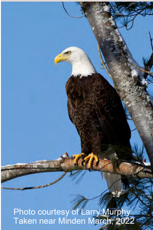
Taken near Minden March, 2022