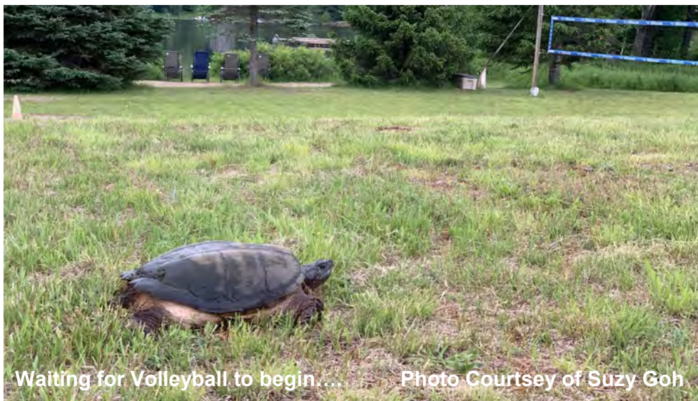
Waiting for Volleyball to begin....

All this work is being done at no cost to Marcus Beach.